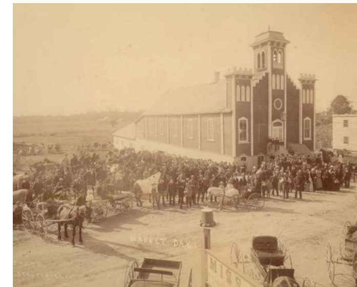
Above: Stouffville's iconic Daley's Hall was built in 1885 at Main and Market Streets. It served as a public hall, market building and ice rink for skating and curling in the basement.

Get more history info at townofws.ca/history